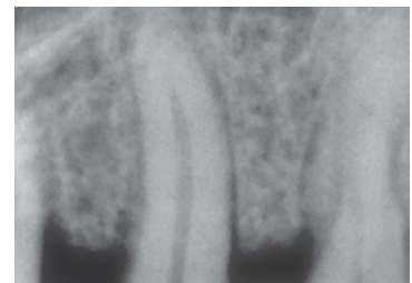
Less defined image

Part of radiograph of same object made with high frequency unit, DC generator, 0.7 focal spot.